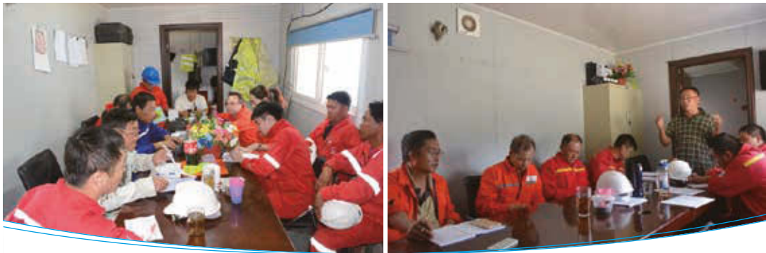
Regular On-site HSE Meeting with Contractors 與承包商定期召開項目現場HSE會議

本集團的HSE政策針對與本集團相關的所有第三方。本集團認為提高所有從事本集團項目工作的第三方的HSE績效是自身的一個職責，其中包括承包商、分包商、供應商和從事集團項目的第三方員工，本集團要求他們必須確保遵守HSE政策。本集團定期邀請承包商討論如安全防範方面的HSE計劃，並要求他們報告在項目現場的HSE問題。在任何情況下，承包商應及時向本集團報告任何關於健康、安全和環境問題的事件或意外。