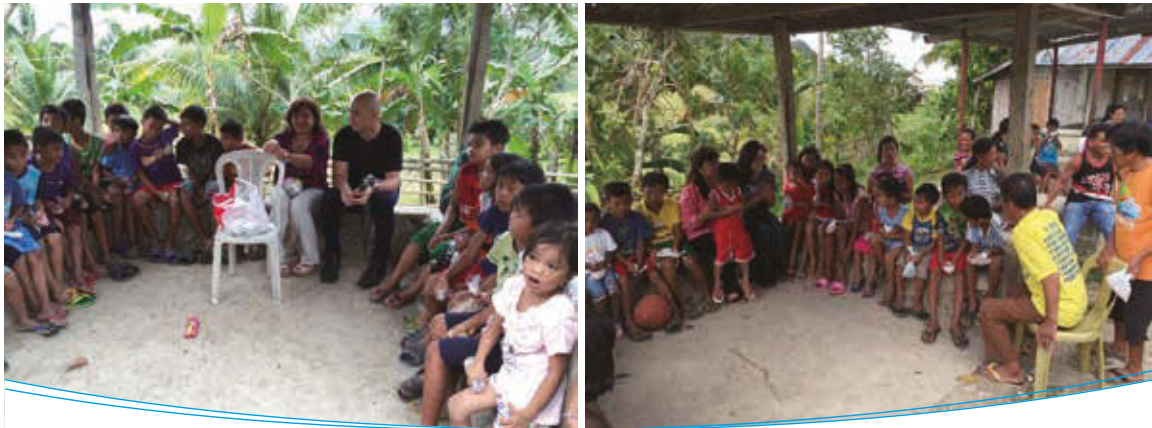
Local Christmas Party Sponsored by PPIG 由PPIG贊助的當地聖誕聚會

本集團支持以符合集團核心價值觀為目標的各項活動。於2016年度，本集團贊助了聯合國兒童基金會(UNICEF)和海通國際「『愛老，愛腦』計劃2017/2018」項目。在宿霧，集團贊助地方政府(LGU)舉辦的慶祝活動，例如聖誕派對等社交聚會。