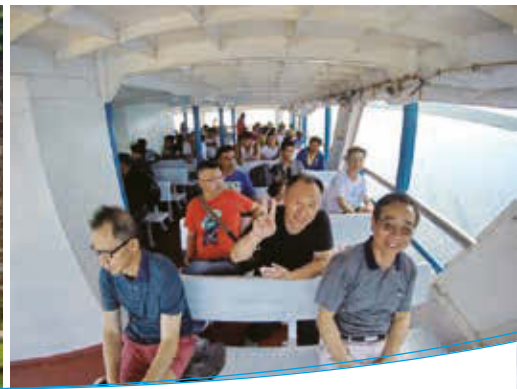
Eco-Tourism of Bohol Island in Philippines 菲律賓薄荷島生態旅遊