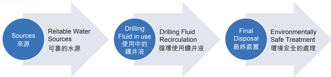
Fig. 2. The drilling fluid management