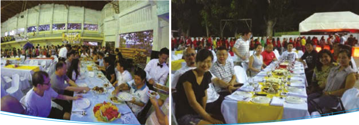
LGU Fiesta Sponsored by PPIG 贊助的地方政府嘉年華會

Polyard Petroleum International Group Limited 百田石油國際集團有限公司