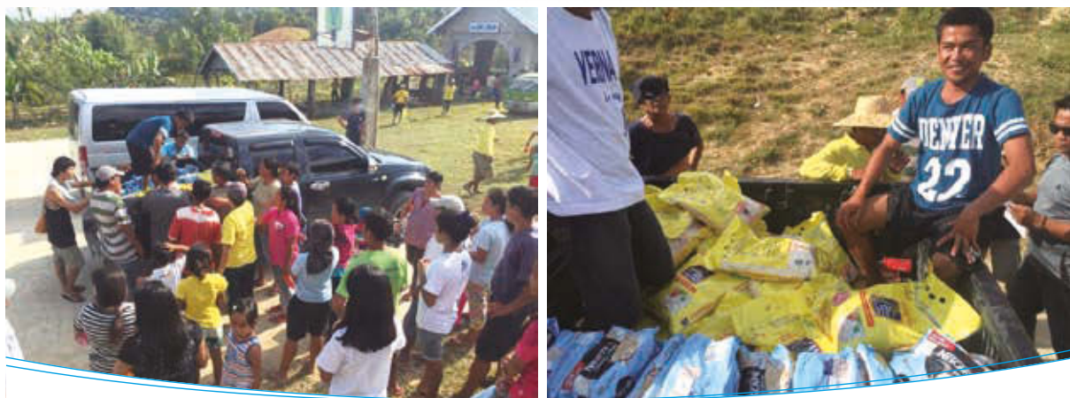
Rice Distribution for PPIG Local HSE Awareness Program PPIG本地HSE意識計劃中派發大米的活動