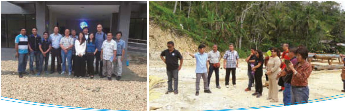
Regular MMT Meeting and Site Inspection 定期MMT會議和項目現場檢查

求。來自項目、承包商、環境管理局(EMB)、能源部、社會福利和發展部(DSWD)、宗教組織和地方環境非政府組織(NGO)的代表組成了一個多方監控小組(MMT)持續監測合規進度。