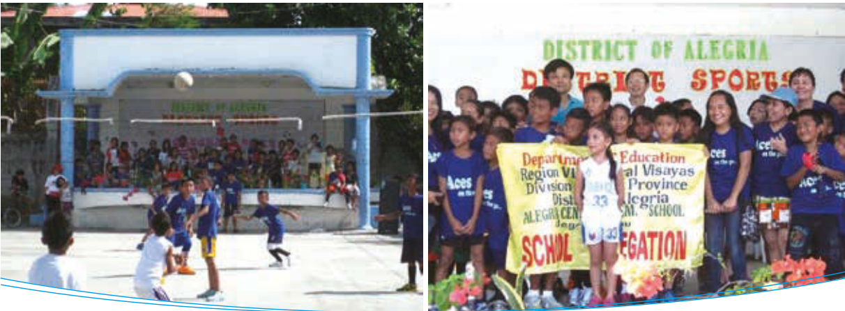
Local Elementary School Sports Day Sponsored by PPIG PPIG贊助的地方小學運動會