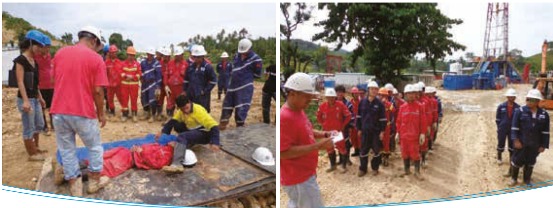
Training for Blowout Prevention Drill 預防井噴演習訓練

風險管理在井噴預防中起著至關重要的作用。項目現場的所有必要員工必須定期參與井噴演習，且出席情況將被記錄。演習的表現由負責人、主管和相關員工進行評估。本集團定期進行井噴預防的審查，若發現需要改善的方面則落實適當的改進方案。本集團已制定井噴應急預案，並會與負責在緊急情況下採取行動的員工進行溝通。