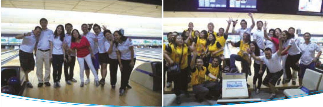
Philippines Oil & Gas Bowling Tournament 菲律賓石油和天然氣保齡球比賽

The Group has no tolerance towards bribery. Either receiving or offering bribes is illegal and not accepted by the Group. Clear rules and statement are attached in the staff handbook. Contractors, sub-contractors, suppliers and third party personnel working on the Group's projects are clearly informed to follow the anti-corruption rules of the Group. The Group takes steps to improve the internal anti-corruption system and enhance the sense of employees.