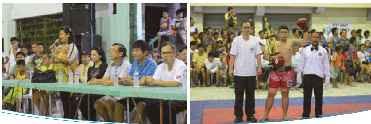
Local Sport Events Sponsored by PPIG 贊助的當地體育賽事